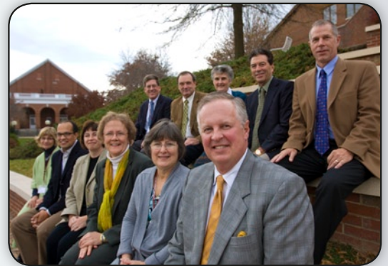
Lancaster Volunteer Board